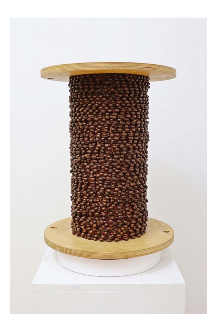
Figure 7. Alex Dolores Solerno, 2021. EXTRAHERE.

Coffee is a world-wide commodity, one of the most traded throughout the world and, for Salerno, a symbol of work culture. Particularly during the 19<sup>th</sup> century, Indigenous peoples in the South, immigrants, and enslaved African people were displaced from the land and exploited as the overwhelming economic benefit of coffee production progressed. This colonial agricultural system of cultivating of one crop continues to have destructive effects on the land, such as "erosion, mudslides, disease, deforestation, and increased dependence on fertilizers, chemicals that result in run off in local water."