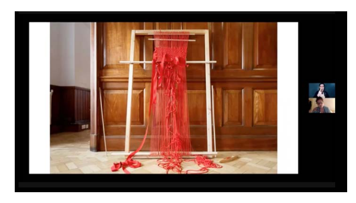
Figure 2. Raisa Kaber, Installation/Performance, 2017, The Body is a Site of Production: Resist, Resist, Resist, The Tetley Gallery, Leeds, UK.

embodied geographies. She uses ancient loom technology to bind together "bodies of color, gendered bodies, disabled bodies, and migrant bodies" in specific types of labor. Her (un)weaving performances comment on power, production, disability, and the queer brown body as a living archive of collective trauma. In her performances she puts her body alongside cloth in institutional and public spaces to make visible the violence of labor on the marginalized body, the body that is perceived as unproductive. Weaving thus becomes an act of resistance to capitalist production, function, and commerce.