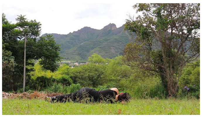
Figure 6. Alex Dolores Salerno, 2020. El Dio Acostado (The Sleeping God), video still.