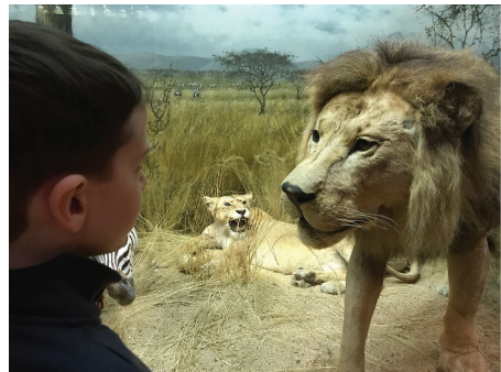
Figure 4. A child in the Natural History Museum in Helsinki, Finland.

monkey body mixes up the idea of who is to become whom and suggests a liquid division between human and nonhuman animal. Is the monkey, with a cigarette in his hand, becoming a human or is the human becoming animal? Baker (2003) noted: "The realism of this piece, which is more like a waxwork or mannequin than a sculpture, makes this aberrant creation (whose body is both ravaged and delicate) particularly disturbing" (p. 154). The artwork seems to take a "step aside from a human, to indicate an other, to signal the animal, and thus to enter that privileged 'experimental' state of identity-suspension