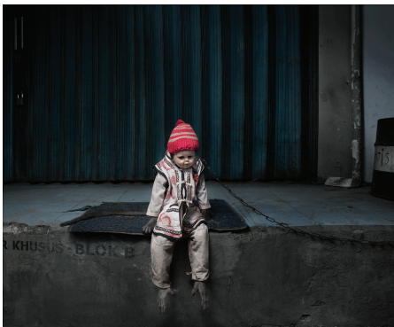
Figure 2. Perttu Saksas, A Kind of You, Untitled , 2013.

In his earlier art project, A Kind of You (Figure 2) from 2013, Saksas explored the exchange across the boundaries between human and nonhuman animals. The tradition of Indonesian street performance used to include teaching pet monkeys tricks and dressing them in masks and clothes, with “monkey masters” forcing them to perform. Saksas stated that, when photographing the monkeys, they were in a bad condition, stressed and sick. He felt particularly sorry for the monkeys, knowing that they are “our closest relatives” (Saksas, 2020, para. 10). Saksas photographed the monkeys with dramatic lighting and a black background. The pictures are portraits of chained, badly treated, and systematically abused animals. The images are violent and sad, showing “a primal human fear: the terror of being enslaved, wholly controlled, at the mercy of forces greater than ourselves” (Wallace, 2020, para. 2).