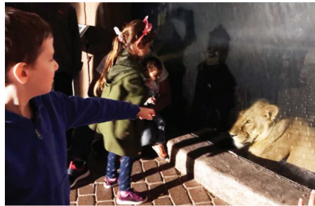
Figure 3. Children in the Al Ain Zoo, United Arab Emirates.

Another example of an animal body as an artistic material is the Untitled (Monkey) , by John Isaac (1995). The hands and feet of the chimpanzee are replaced by the cast hands of a 5-year-old child. The assembly of human and